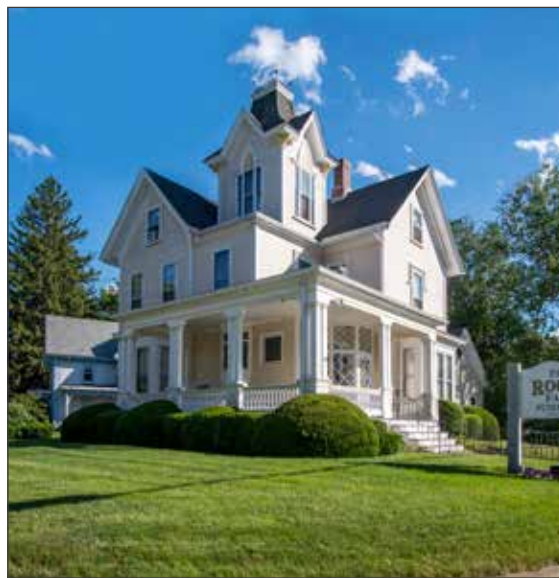
Paul C. Rogers & Sons 36 West Main St. Merrimac, MA 978-346-9273