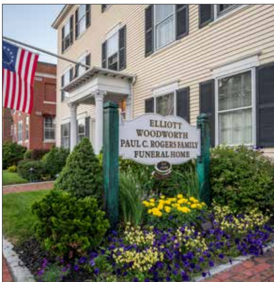
Elliott, Woodworth & Rogers 35 Green Street Newburyport, MA 978-462-4323