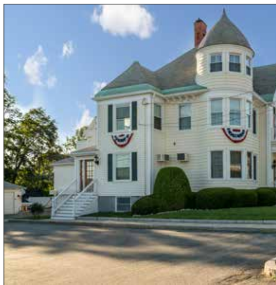
Paul C. Rogers & Sons 334 Main Street Haverhill, MA 978-373-3281