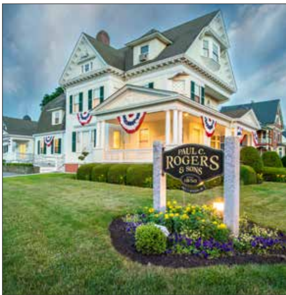
Paul C. Rogers & Sons 2 Hillside Avenue Amesbury, MA 978-388-0288